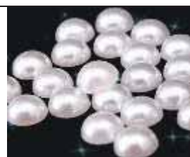
Z24 White / Pearl