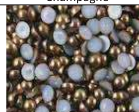
Z58 Antique Gold