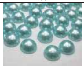
Z19 Cyan Blue