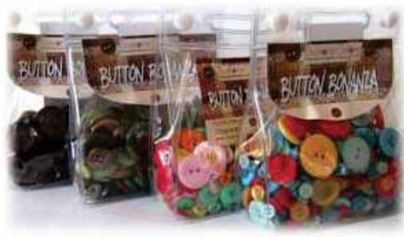
Bittersweet BB66 Campy BB85 Tutti Fruity BB71 Off to School BB80