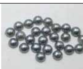
Z41 Dark Grey