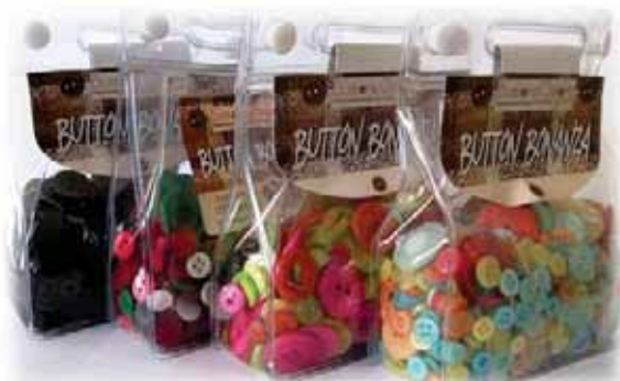
Black BB19 Christmas BB44 Fiesta BB61 Summertime BB46